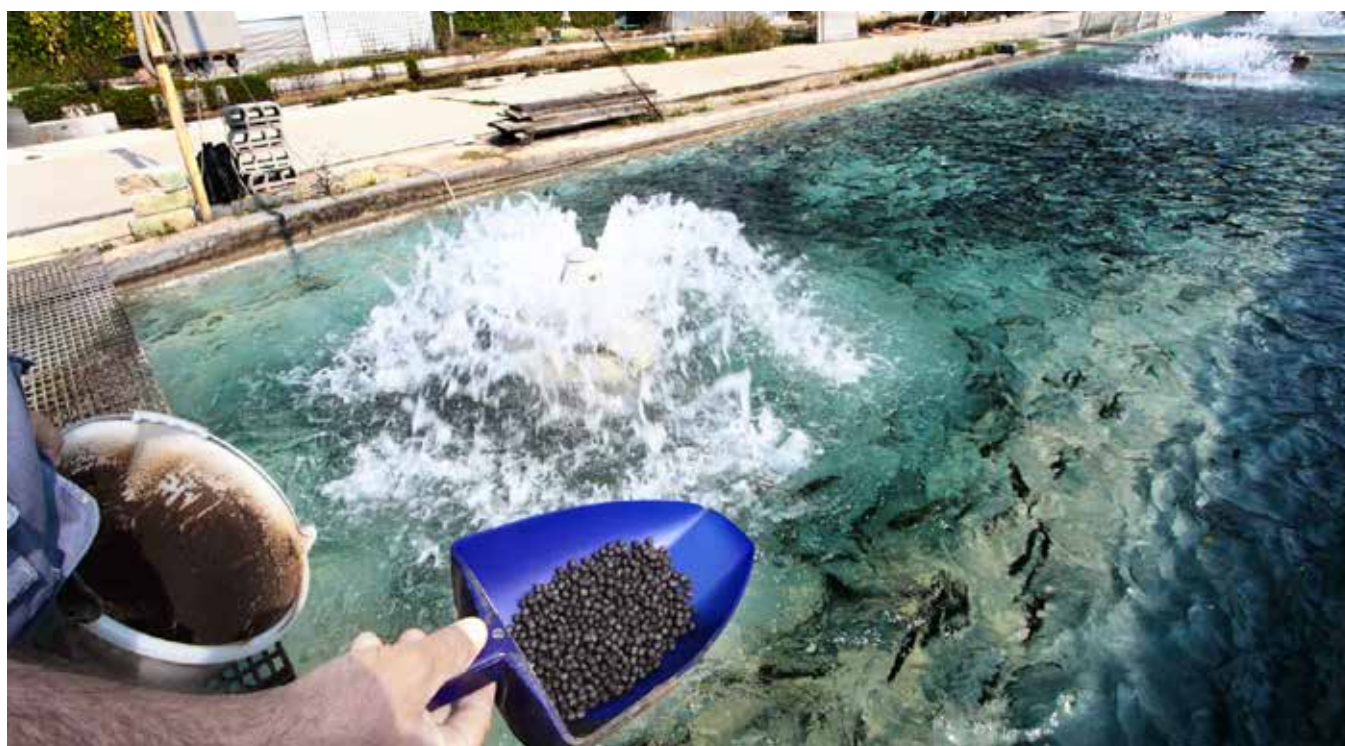
Fish farm at Bussi, in Abruzzo, Italy.

Aquaculture is facing a new era of expansion in Europe. What are the environmental implications of this, and how can the sector expand sustainably? This Future Brief from Science for Environment Policy presents an overview of research into aquaculture's impacts, and considers how it could develop in harmony with environmental goals.